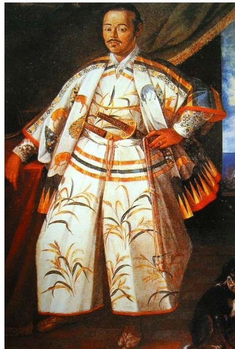
Figure 2. Claude Deruet, Hasekura in Rome (1615). Borghese Gallery in Rome