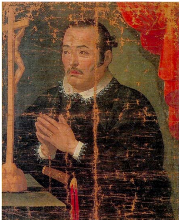
Figure 1. Hasekura in Prayer (ca.1615). City Museum of Sendai.